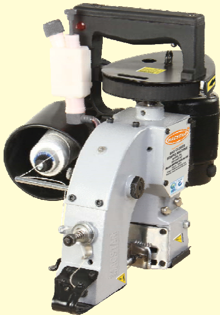
MODEL DA (SINGLE NEEDLE SINGLE STITCH)